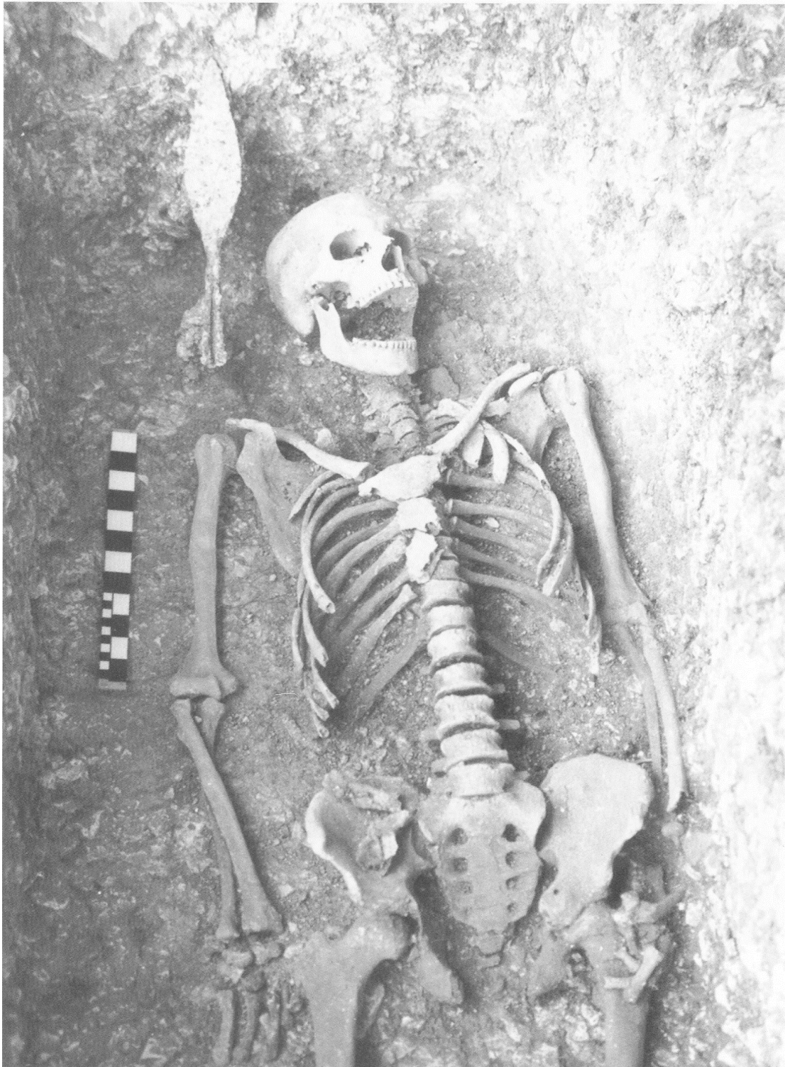
Figure 14.4 Adult male aged between 40 and 50 years of age interred with a spearhead and knife from grave 83, Worthy Park, Kingsworthy, Hants. Reproduced with kind permission after Hawkes & Grainger 2003: 139. © Oxford University School of Archaeology.

the final back-filling event (Filmer-Sankey and Pestell 2001: 226). This means that the inhumation was a display that could facilitate a range of rites before, during, and after the composition of the grave.