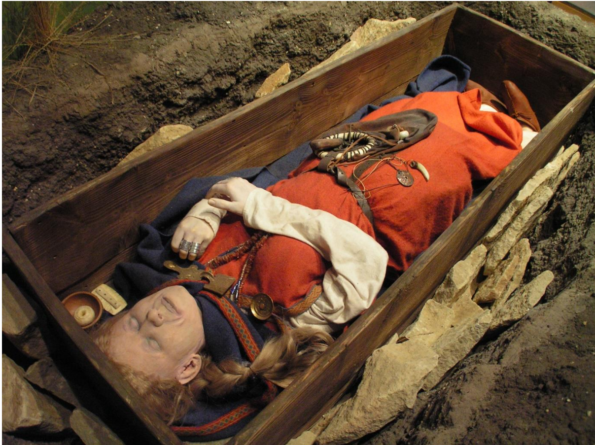
Figure 14.3 A wealthy sixth-century grave of an adult female aged between 25 and 30 excavated at the early Anglo-Saxon cemetery from Butler's Field, Lechlade, Gloucestershire, and reconstructed in the Corinium Museum, Cirencester

Clothing and grave-gifts were only aspects of the furnished inhumation burial of the early Anglo-Saxon period. The traces of coffins are found in many burial sites, as at Spong Hill, Norfolk (e.g. Hills et al. 1984: 6). Some of the complexity of soft furnishings present in early Anglo-Saxon graves is revealed through the careful examination of mineralized textile remains (Harrington 2007). At Snape, Suffolk, the soil conditions revealed other forms of internal grave structures. These included organic linings and coverings, as well as biers and even whole boats used to contain the body (Filmer-Sankey and Pestell 2001: 204–14). This last phenomenon is a rare occurrence but was evidently the forerunner to the use of larger sea-going vessels beneath burial mounds at Snape and Sutton Hoo in the late sixth and early seventh century (Carver 1995).